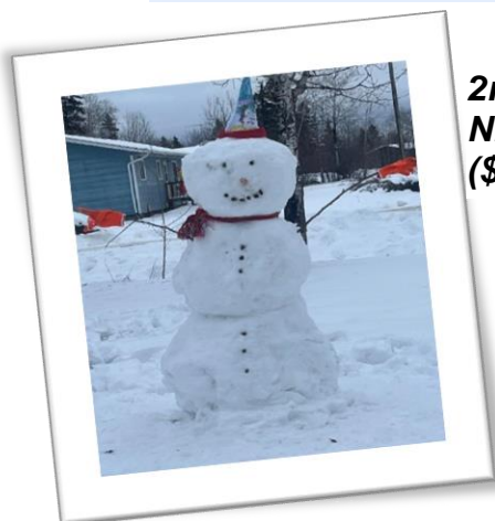
2nd place: Nikita Cortney ($75 gift card)